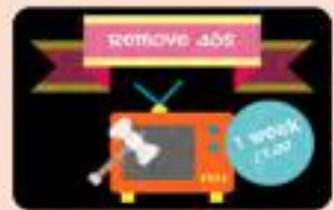
Pay to shop advertisements

We should behave safely and respectfully both on and offline.